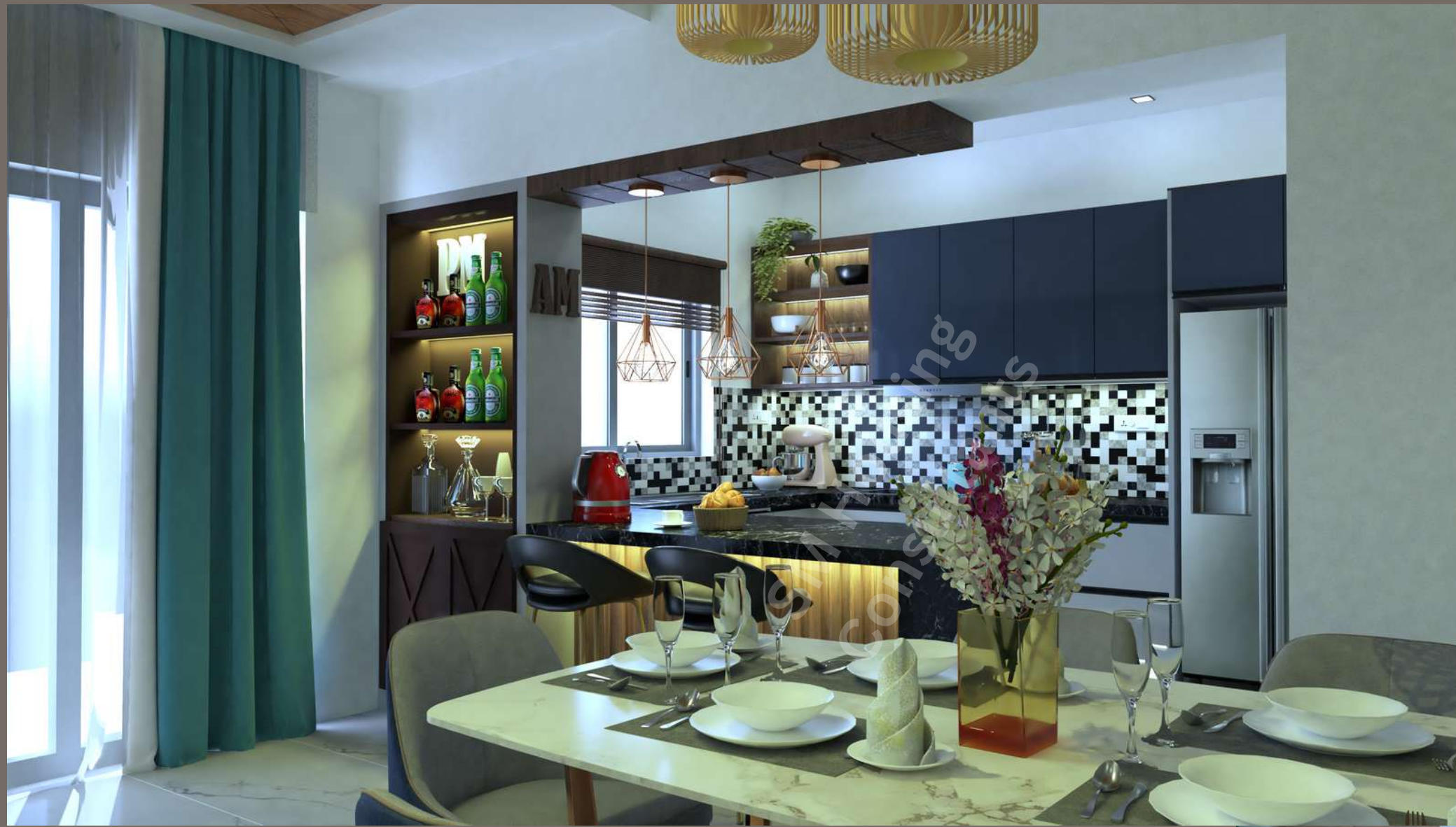
LIVING ROOM + DINING AREA, GURGAON