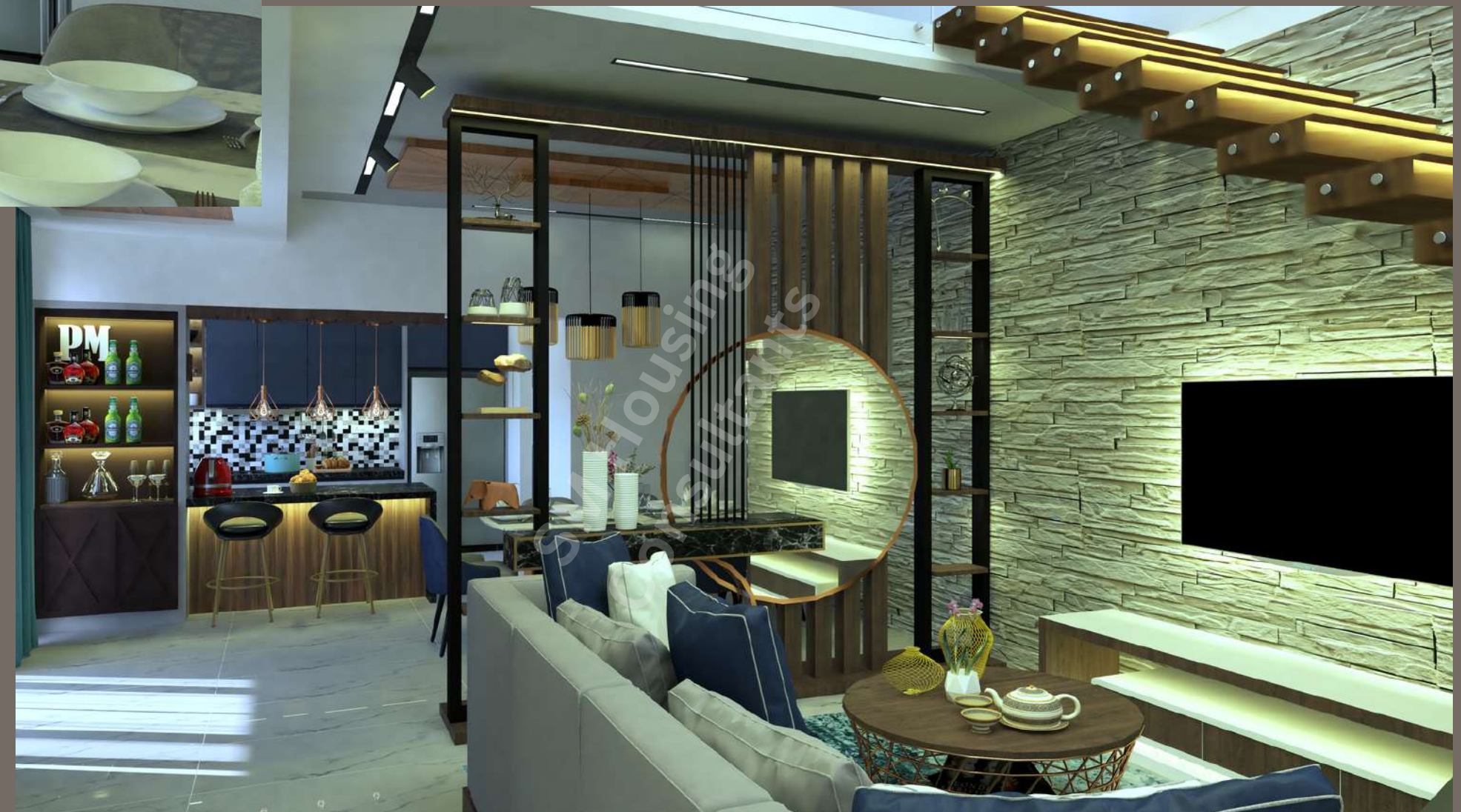
KITCHEN + DINING ROOM, GURGAON