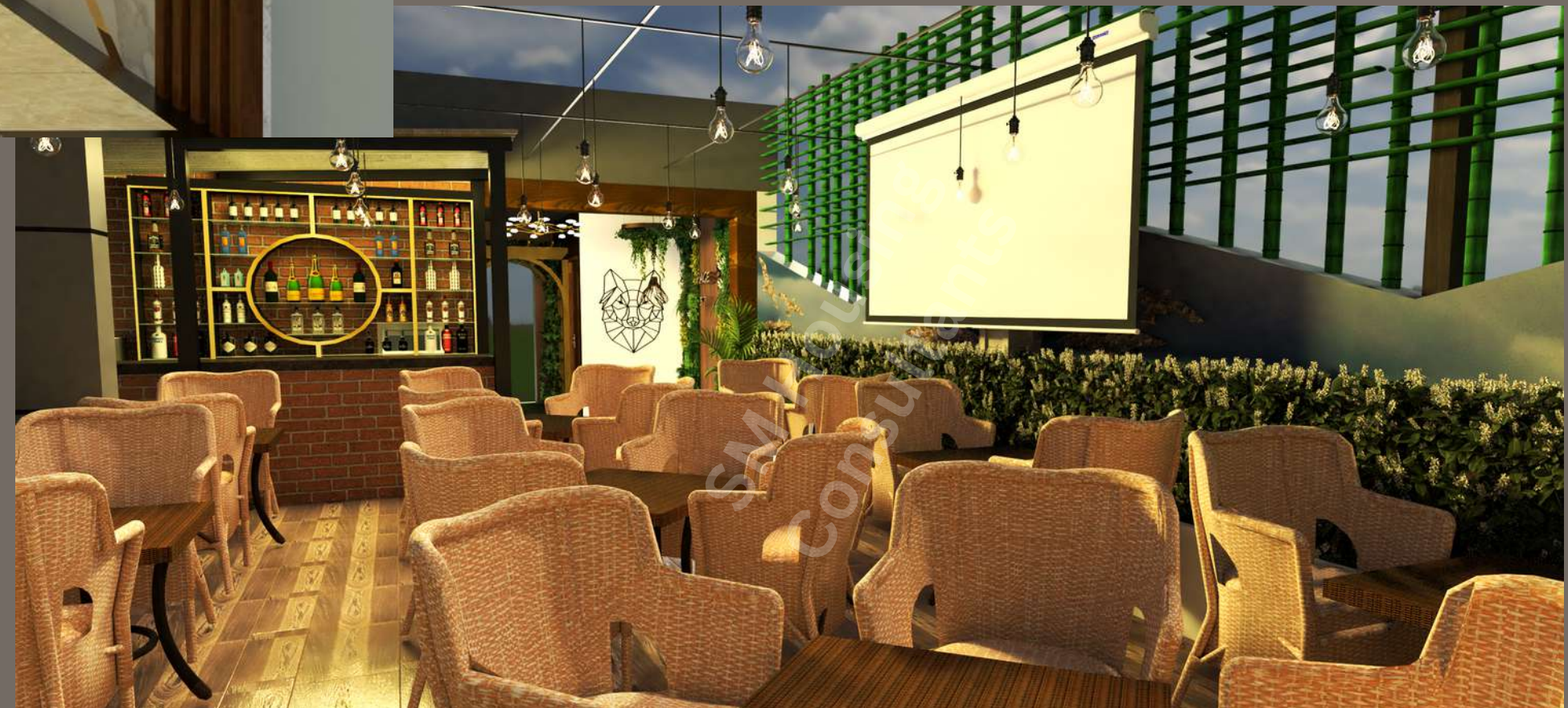
OPEN TERRACE RESTURANT,NOIDA