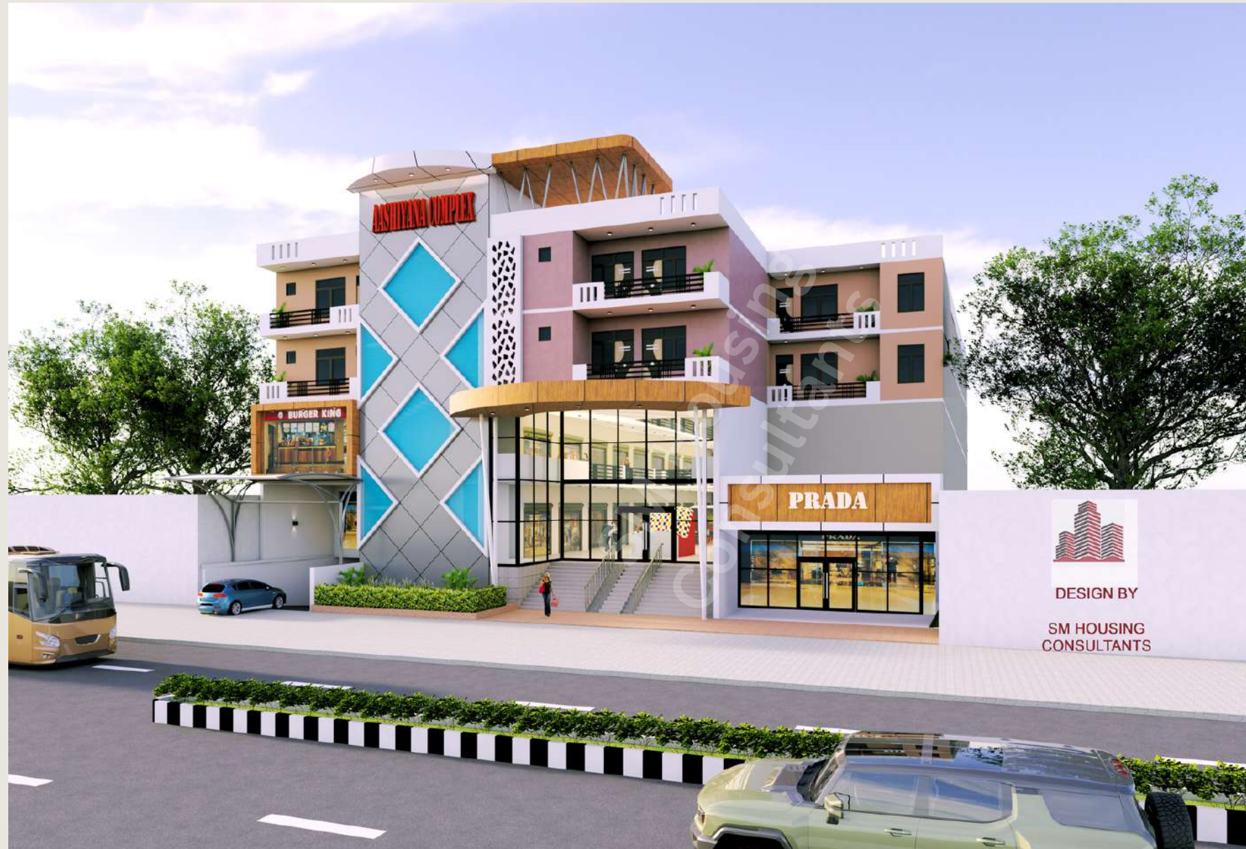
COMERCIAL COMPLEX, KHAIR