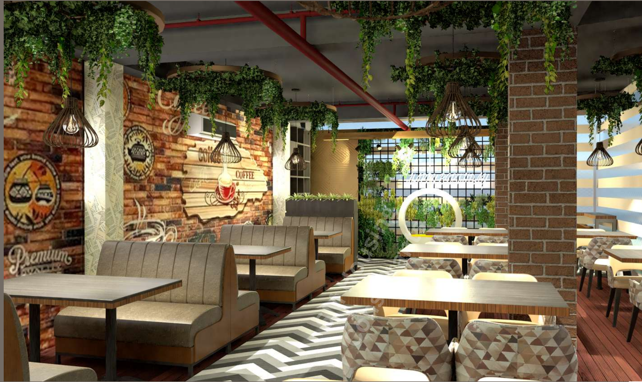
RUSTIC THEME RESTURANT, NOIDA