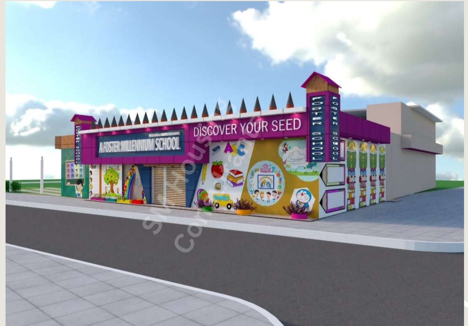
FOSTER MILLENIUM SCHOOL, ALIGARH