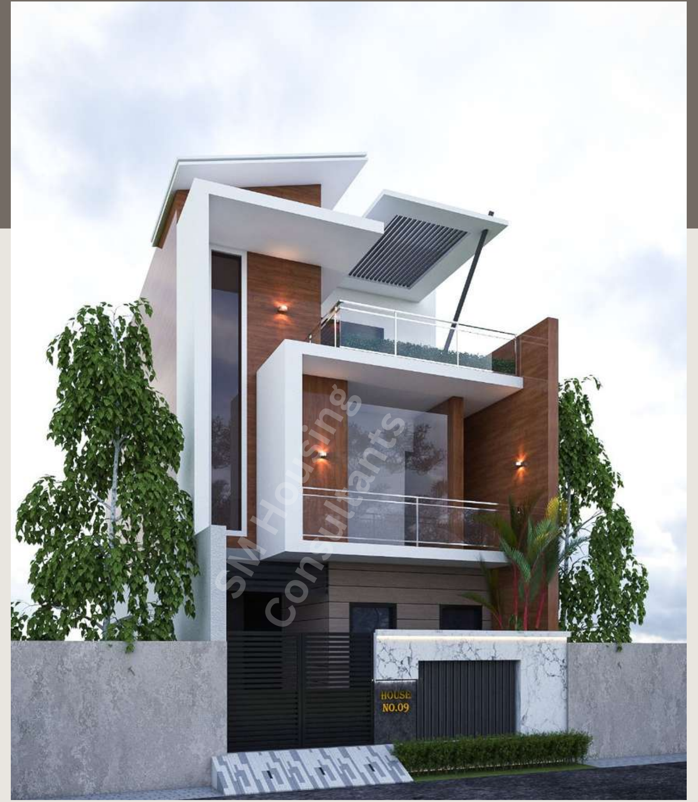
SURYA VIHAR COLONY,ALIGARH