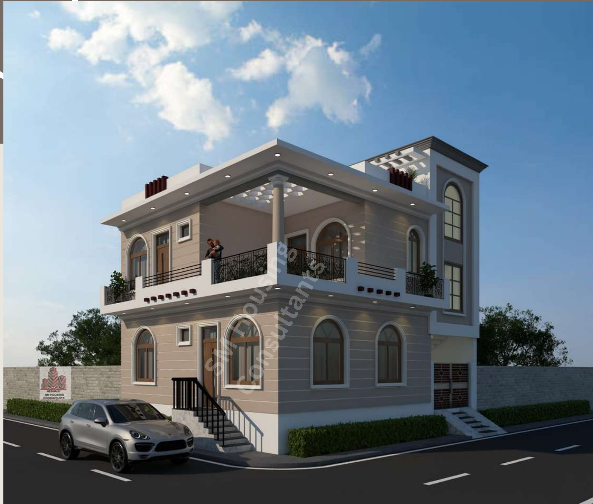
PATWARI NAGLA DUPLEX,ALIGARH