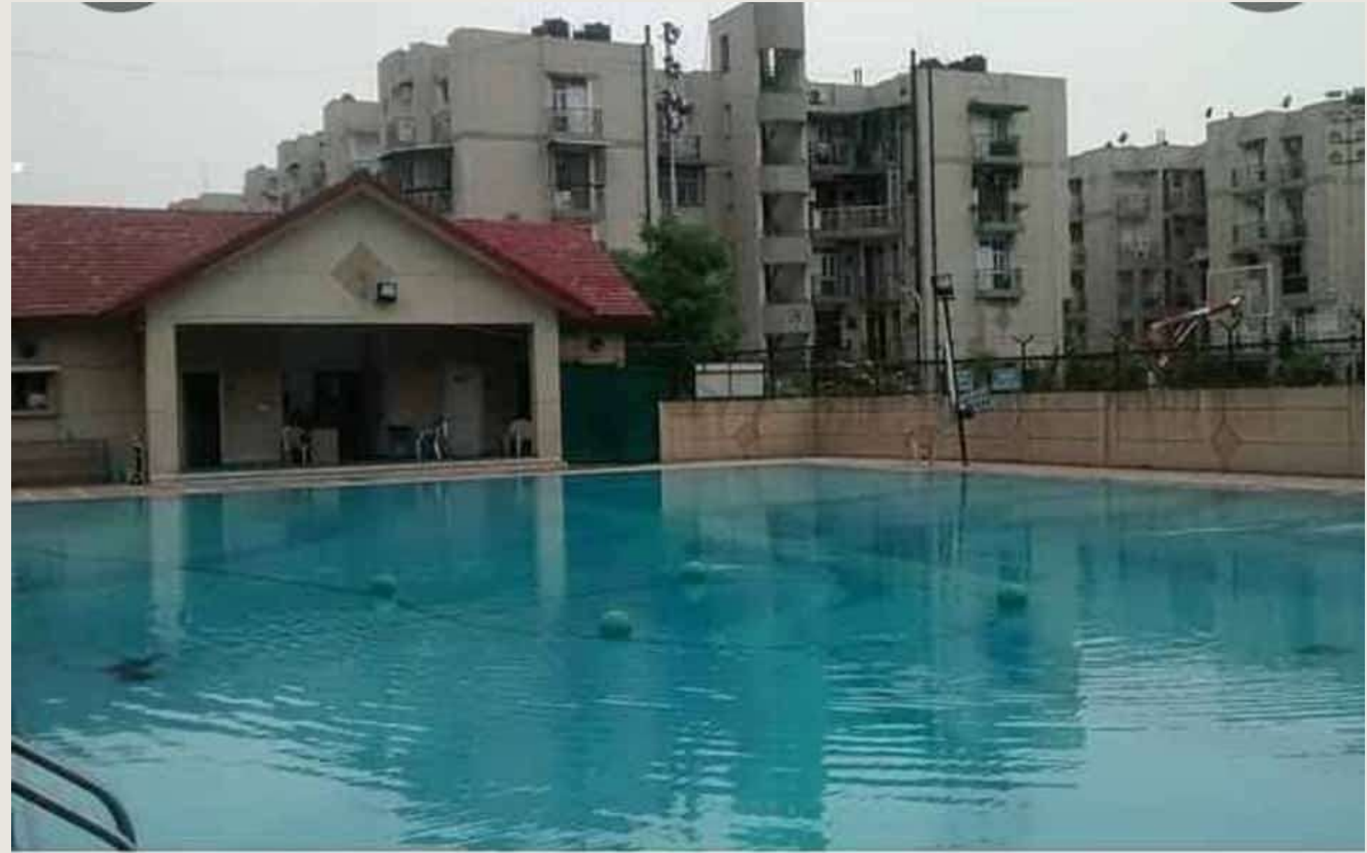
SWIMMING POOL+400 FLATS OF A.W.H.O., SEC 82 NOIDA