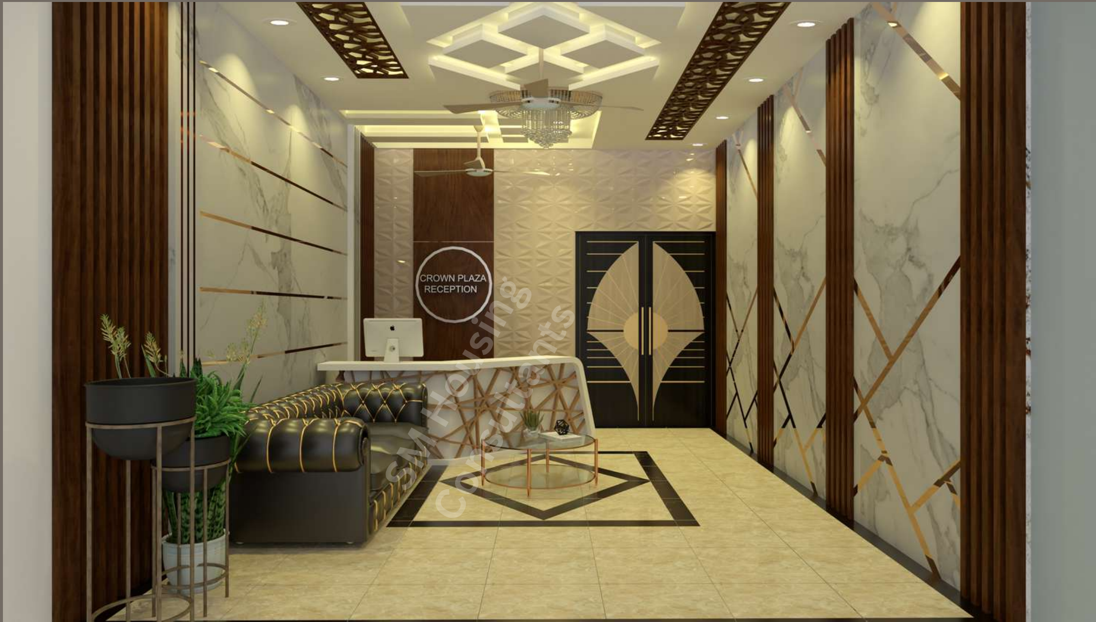
HOTEL CROWN PLAZA RECEPTION,ALIGARH