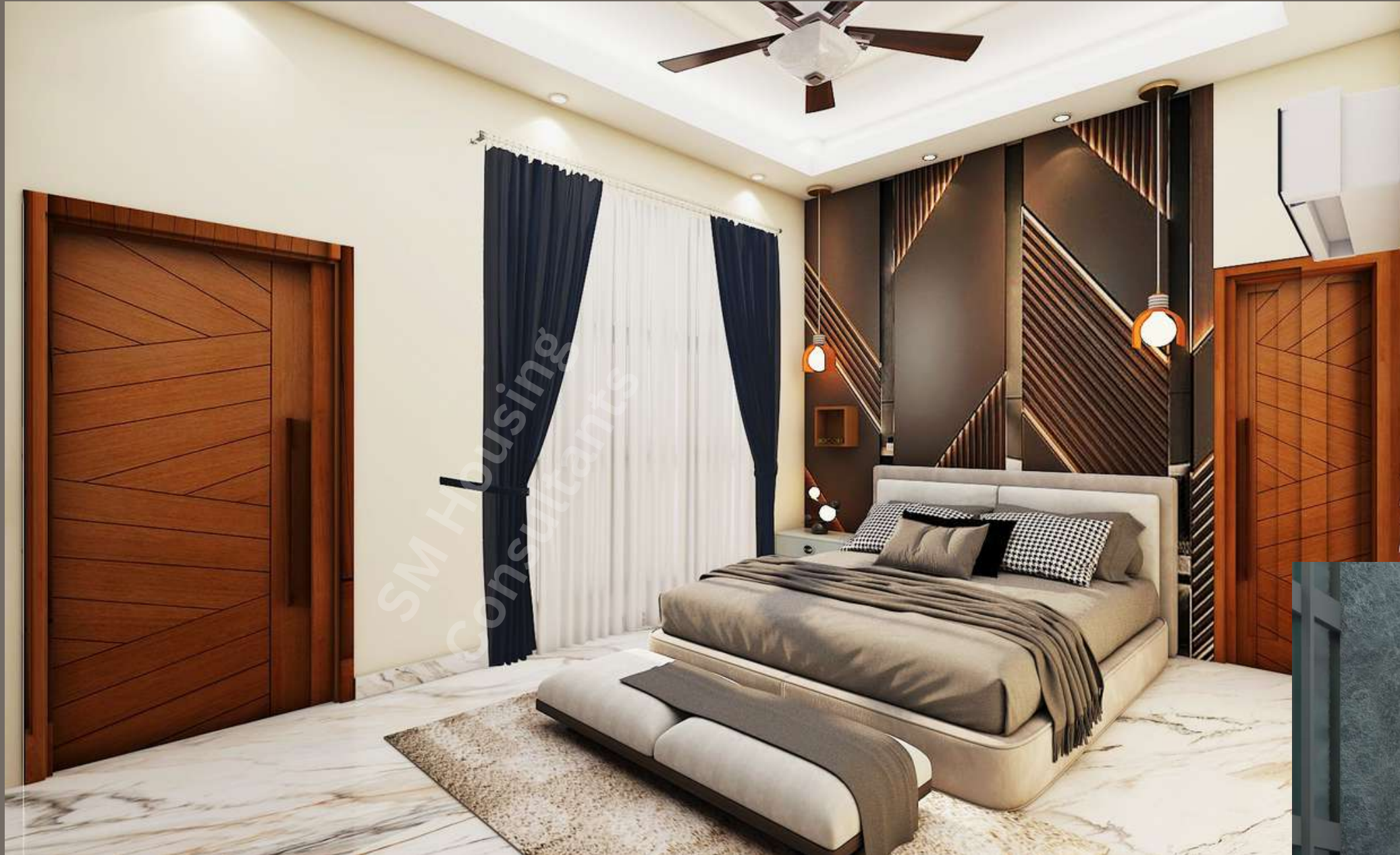
BEDROOM-RESIDENTIAL HOUSE ,GURGAON