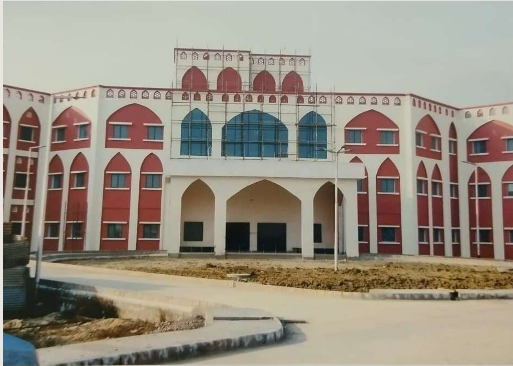
A.M.U MEDICAL, ALIGARH